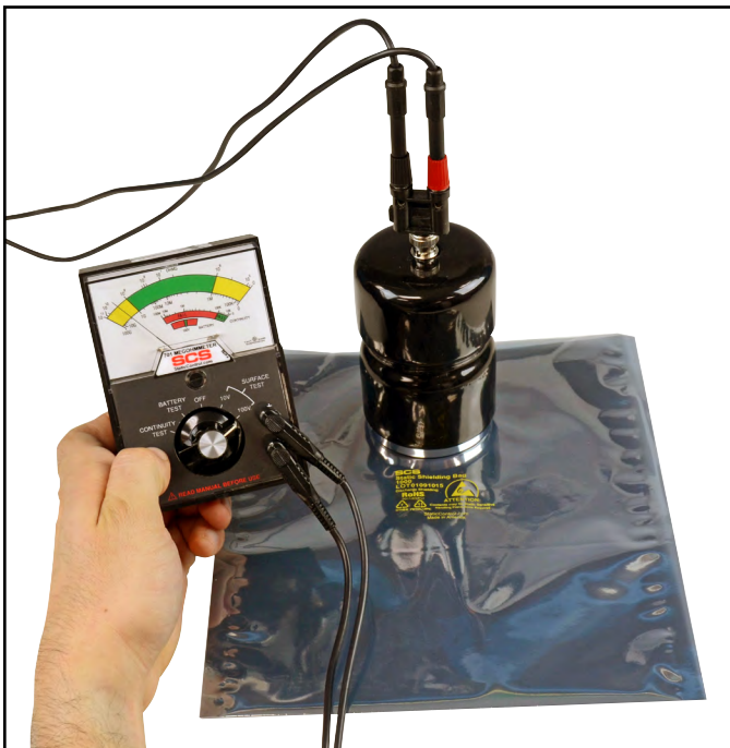
Figure 3. Using the Concentric Ring Probe with the SCS 701 Analog Surface Resistance Megohmmeter